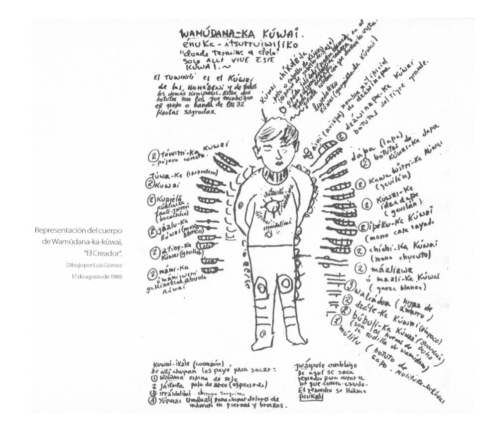
Figure 3: Kuwa

The all-encompassing totality of Kuwai 's being, the powerful univocality of Kuwai 's sounds, the "powerful sound that opened the universe" ( limale-iyu ) is unique among Amazonian cosmologies for its capacity to encompass within its spiritual body the multiplicity and diversity of the material world. It is not difficult to understand why such a tremendous power should be kept a secret, too dangerous to handle; a potentially destructive creativity, or equally, a potentially creative destructiveness (as in regeneration), the spirit of Kuwai is obliged to remain hidden, yet it is the instrument by which all life is reproduced. The remarkable elaboration of this all-encompassing power demonstrates a truly complex metaphysics which this brief piece has barely scratched the surface.