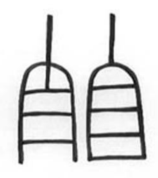
Figure 2: Dzauinaapa

The trumpet called Jaguar Bone , Dzauinaapa is the thorax of Kuwai , or ribcage, iwarudali , the longest and most powerful of the trumpets that propitiate transformation in whomever or whatever the Jaguar Bone song is intended to change. In the narrative and in the drawing of Kuwai-ka-Wamundana reproduced below (Fig. 3), the 2 trumpets are contrasted with the wasp sound ( Aini ), produced by play instruments made by the first children initiates, and which were considered to be a "false kuwai , nonsense". Kuwai himself contrasted these buzzing wasp flute imitations of the children with the truly powerful sound of Jaguar Bone that made the world grow and culture be reproduced.